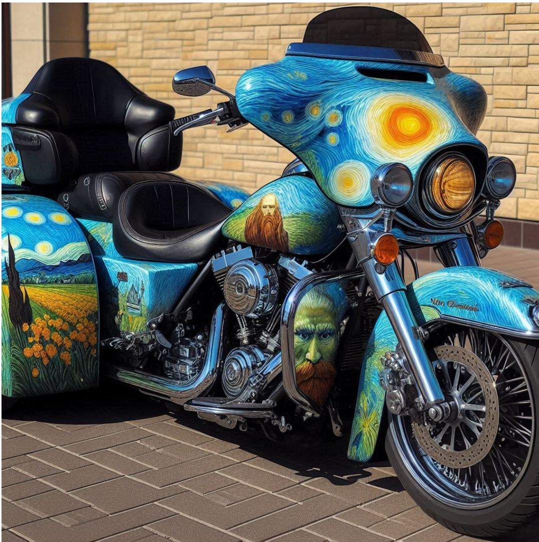
VAN GOGH TRIKE