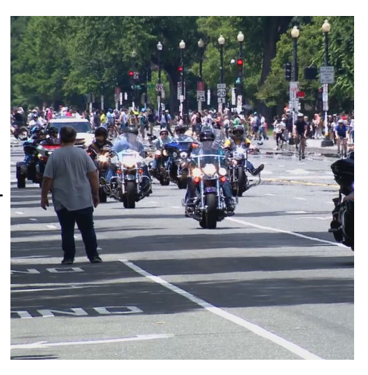
ROLLING TO REMEMBER

That list is never ending. Our commitment to community and helping is almost ingrained into "bikers." We are also misjudged, mislabeled, scorned, and looked down upon. People watch movies and think we are gangs looking to destroy property and fight everyone. When, in fact, we are businesspeople, doctors, lawyers, police, military and veterans, sons, daughters, grandparents and care takers. We fit into almost every lifestyle with one big difference, we love to ride. A good portion of us belong to a group, a club, a collection of